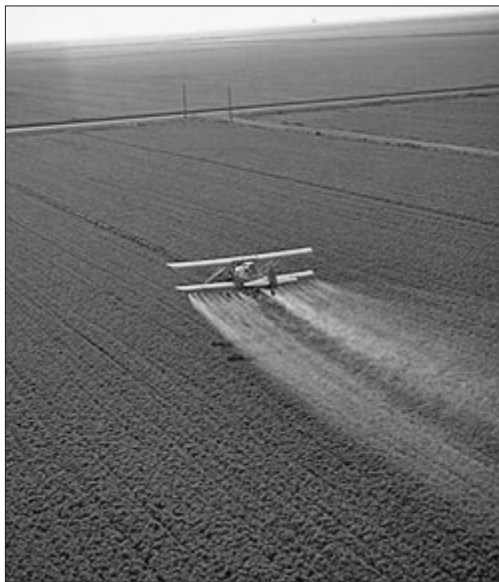
(USDA, Charles O'Rear, April 2008)

Applicators must read and follow the correct application rates according to the pesticide product label. Pesticide treatment rates often vary by application site or target pest. Many RTU (ready to use) formulations don't need calibration, however,