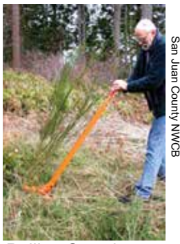
Pulling Scotch broom with a weed wrench

Manual/Mechanical methods: physical control of weeds using methods such as hand-pulling, digging, mowing, and tilling. For a few plants and small infestations, handpulling or digging can minimize soil disturbance while leaving desirable species intact. Other mechanical methods, such as tillage, can be effective on larger infestations. However, tilling can stimulate weed seed germination, so further control methods may be needed. Mowing may be used as a first step to prevent weeds from going to seed before conducting other control methods. Repeated mowing in the same season may be used on some weed species to drain the weeds of their resources, eventually leading to control. Be aware that other species flower later and at a lower height after mowing.