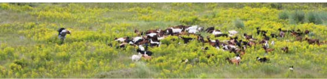
Goats grazing on leafy spurge (Euphorbia esula) in eastern Washington.

Biological control methods : releasing biological control agents, such as insects that feed on seeds or other plants parts, and using animals such as goats for grazing, to control weeds. Classical biological control agents are organisms, commonly insects, introduced from the native range of the target invasive weed, which are intensely researched and tested to make sure they will only attack the target plant. These agents will take time to build up their populations, but can be self-sustaining and able to reduce the target invasive weed to low population numbers in time, though there are some natural population fluctuations. There are several widespread noxious weed species in Washington with approved classical biological agents.