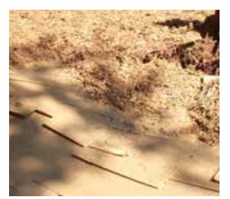
Sheet mulching, here with layers of cardboard and woodchip mulch, serves to smother the noxious weed yellow archangel and prevent any weed seeds from growing in a park.

Cultural methods: altering site conditions to be less favorable for weeds and more favorable for desired plants. For example, increasing soil moisture or nutrients can increase the competitiveness of desirable species. Soil solarization uses clear plastic to heat the soil for a full growing season to destroy or reduce weed seeds within the upper soil layer. Controlled burns can be effective against some weed species, although regrowth may need to be burned again. Check for state and local restrictions, burn bans, or permit requirements before burning.